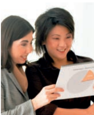
Image quality, ease of use, productivity, media latitude, feeding and finishing options, plus world-class workflow solutions are at your fingertips. Grow your digital colour printing capabilities and reduce costs with the Xerox® Colour 550/560 Printer.